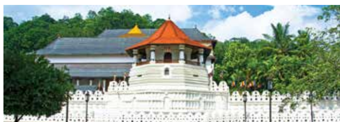
Temple of the Tooth - Kandy

0730hrs Breakfast at hotel 0830hrs Coach transfer to Kurunegala Welagedara Stadium for 3rd match of the tour 0900hrs 40 overs match vs R.S.A School Kurunegala U 16/17's 1230hrs Lunch at the ground Post match, enjoy socialising with your opponents before returning to your hotel 1930hrs Dinner and overnight stay hotel.