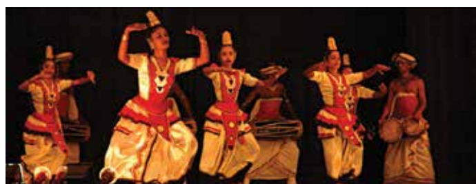
Cultural Show in Kandy